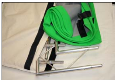
VFX100 KIT BAG